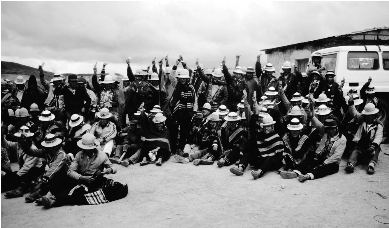
FIGURE 4 During the annual ayllu assembly, authorities representing the traditional ayllu organization and the modern sindicatos participate with equal rights.

Nature, which in turn allowed a reinterpretation of the ecological situation in relation to social and religious–spiritual life. The connecting element between Nature and society is a morally correct action, but in this particular case, acting “correctly” not only means fulfilling a set of defined moral values; it also implies that the community must understand the world according to Andean concepts of life, Nature, and society. This represents a shift from single- to double-loop processes of social learning. Thus, solutions to current problems are essentially perceived as a social and cognitive issue that requires combining deep reflection with an ongoing effort to decode, differentiate, and internalize ethical principles in everyday actions, resulting in an increase of social competencies that permits internally driven transformations of social organization.