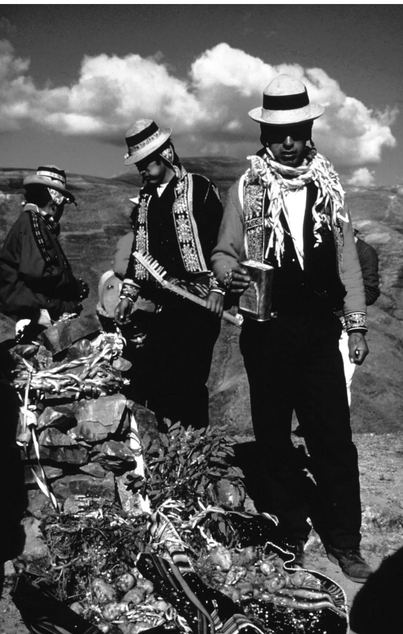
FIGURE 3 The revitalization of rituals dedicated to Pachamama (Earth's mother) was an important element in reintegrating separate groups within the communities.

for example, through increased use of organic fertilizers or shortening of the fallow period on the ayanokas , was perceived as a potential alternative. Meanwhile, other sindicatos advocated privatization of land as a precondition for intensification of land use.