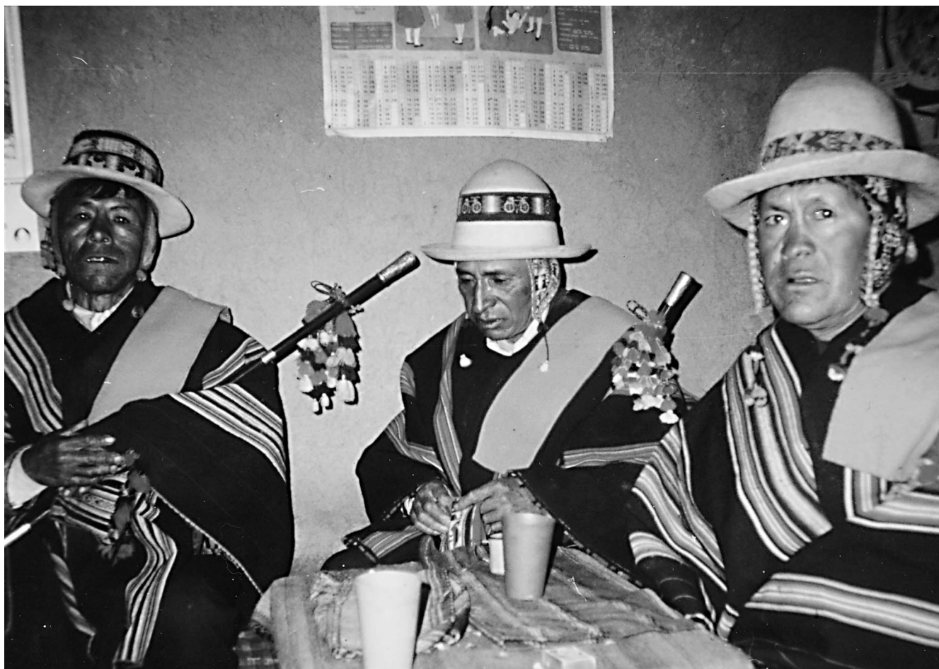
FIGURE 1 The 3 mallkus are the highest authorities of the ayllu . The symbols they wear represent the link between present-day ayllu organization and organization during colonial and precolonial times.

to different periods in the evolution of their land-use system. Using a transdisciplinary approach, the study was part of a process of “accompaniment” of communities based on intercultural dialogue (Rist et al 1999).